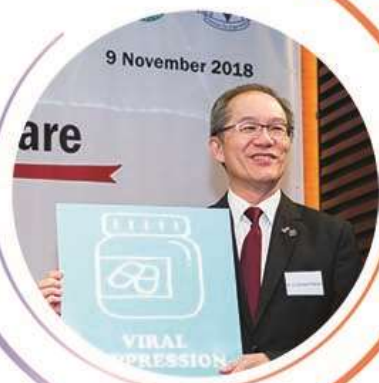
愛滋病研討會 HIV/AIDS Conference