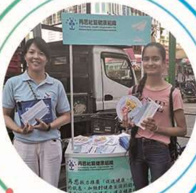
公眾宣傳活動 Publicity Campaigns