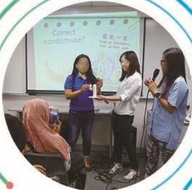
愛滋病教育講座 HIV/AIDS Education Seminar