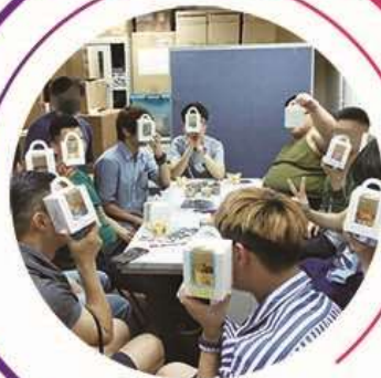
「彩虹日」活動 "Rainbow Day" Activities