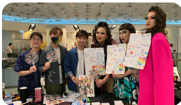
Pride Month 2023 於 iSquare 擺設公眾教育攤位