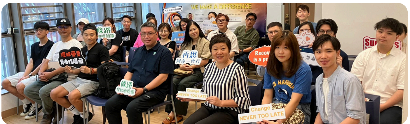
專業培訓計劃-WE MAKE A DIFFERENCE (09/09/2023)

"Unity is strength." Relying solely on our organization is not enough to create significant changes within the entire community. Therefore, we maintain close contact with the government and various organizations. Over the past year, we have organized several training sessions to discuss the latest information on HIV prevention and treatment, as well as support for substance abuse. We have invited local organizations, scholars, healthcare professionals, and experts in drug counseling to participate and share their insights. This provides an opportunity for industry colleagues to exchange ideas and learn from one another, utilizing each other's experiences to deliver more effective services to the community.